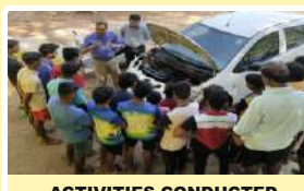
ACTIVITIES CONDUCTED UNDER ATMANIRBHAR BHARAT