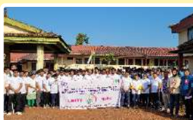
UNITY RUN EVENT