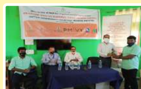
PMKVY - TOOLKIT DISTRIBUTION PROGRAM