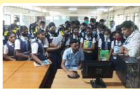
SCHOOL STUDENT VISIT