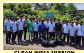
CLEAN INDIA MISSION BY SATTARI ITI TRAINEES