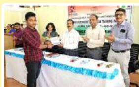
CONVOCATION CEREMONY 2022