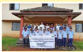
INSTITUTE INFRA STRUCTURE DEVELOPMENT PROGRAMME