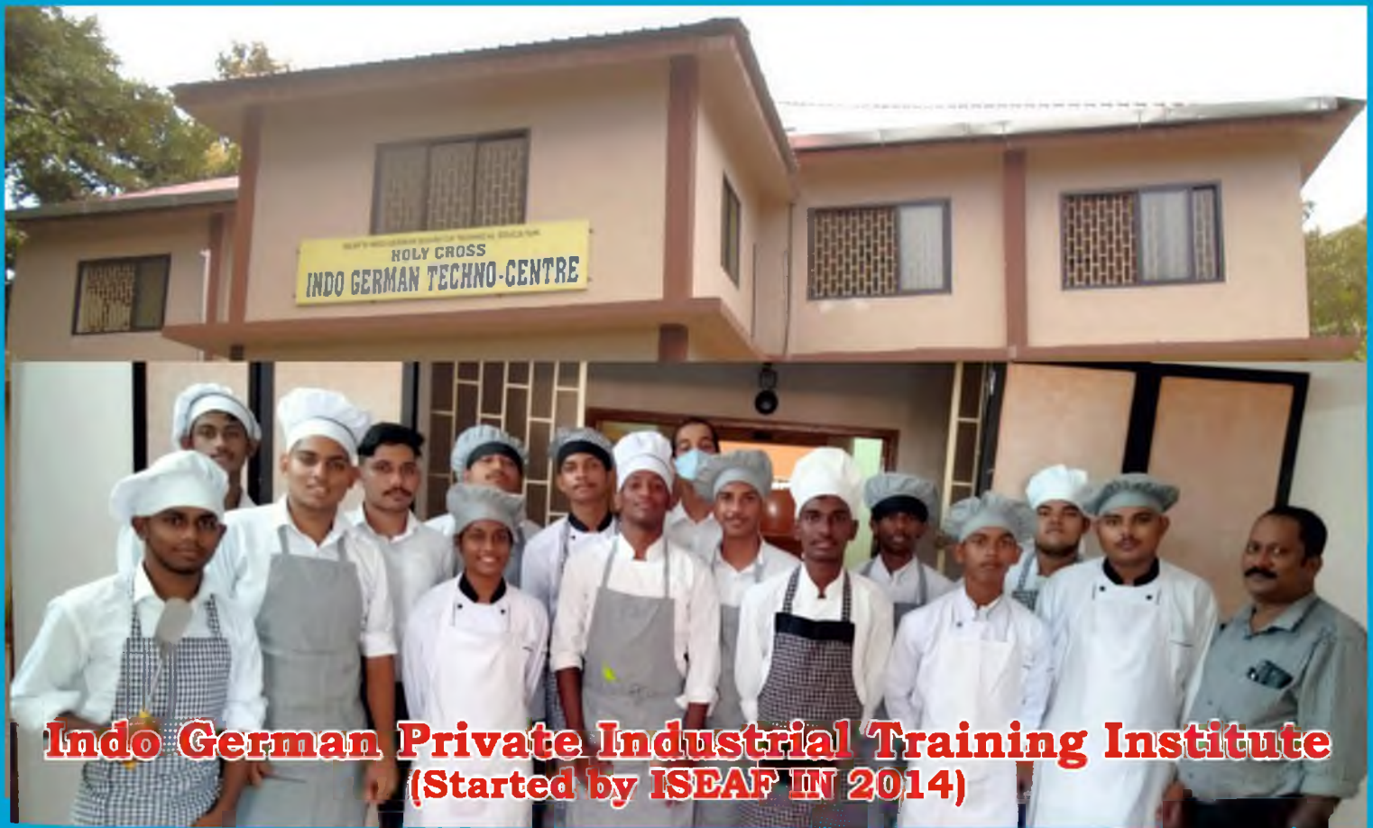
Indo German Private Industrial Training Institute (Started by ISEAF IN 2014)

Indian students Educational Aid Foundation (ISEAF), a registered NGO, sponsored by Ausbildungshilfe Indian e.v, a German Organization is pleased to inform you that we have set up three technical training institutes under the Craftsman training scheme in Goa with an objective to ensure a steady flow of skilled personnel to public and private sectors